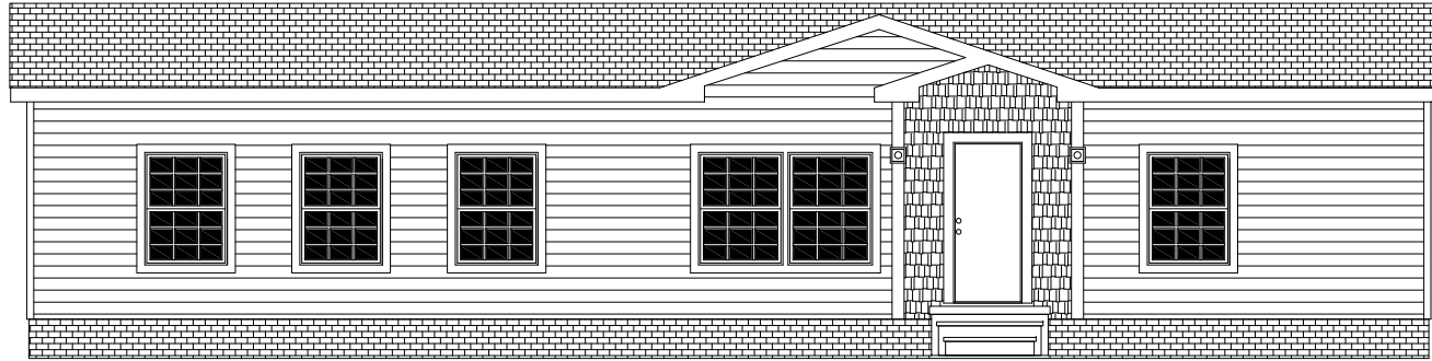
EXTERIOR VINYL SHAKER PACKAGE (STD)